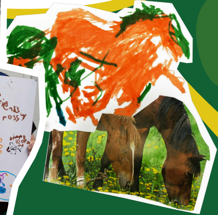
Collages created by children of St. Michael's Way