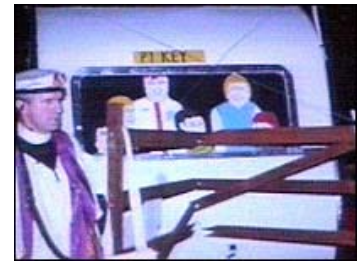
The Effigy at Firle

The county wide Sussex Traveller Forum is to be revived, it has not met for a year. The TLRC and FFT have been petitioning for this. At a district level forums of dialogue will be established with local Travellers.