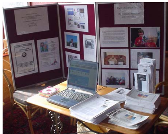
FFT stall at the Derbyshire Gypsy Liaison Group's Travellers Education Resources Day in September

FFT contacts, other Gypsy and Traveller organisations, legal assistance, planning advice and more..... For more contacts, please visit www.Gypsy-Traveller.org/contacts.htm