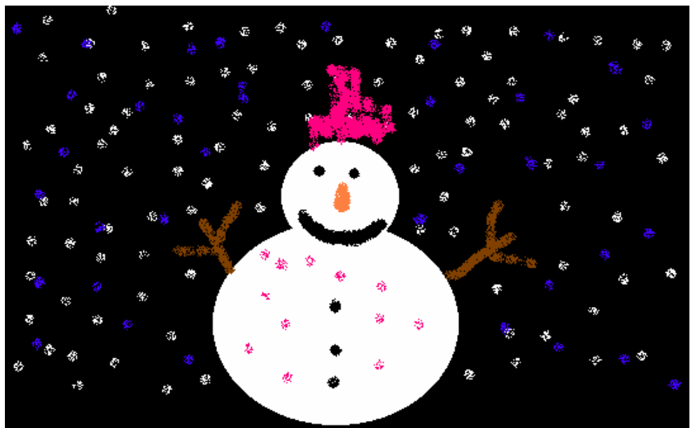
Minnie's Xmas Picture. For more pictures www.Gypsy-Traveller.org/cyberpilots/gallery

Try the Trailer Wordsearch from www.comelookatus.org