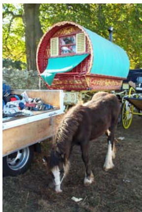
FFT's photos taken at Stow Fair Autumn 2003

"If they had burnt an effigy of a mock synagogue there would have been absolute outrage,"