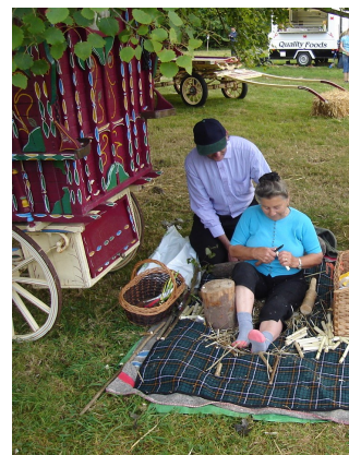
Peg making at Romany Routes Festival

Weald and Downland Open Air Museum, Singleton, Chichester, West Sussex, PO18 0EU. This is a great Festival, celebrating the lives and culture of Gypsies and Travellers, and it would be a huge loss if it were discontinued. Don't let this happen – write in with your support today!