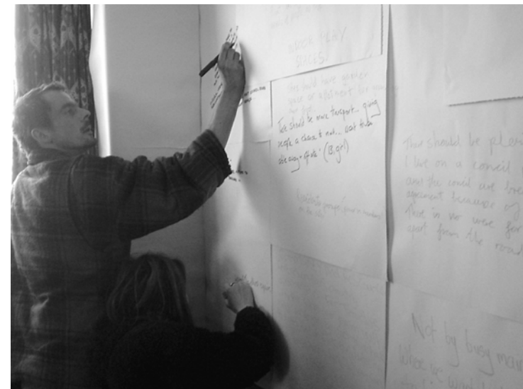
Participants at a workshop