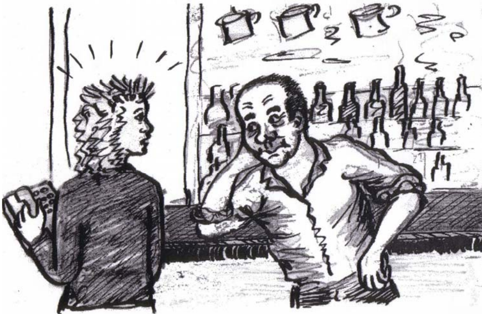
"HAVE YOU GOT .....?"