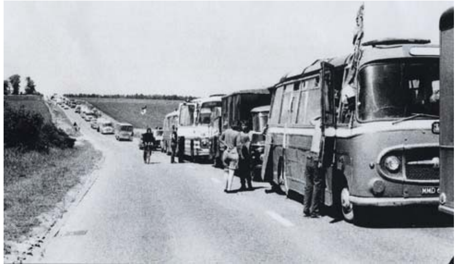
As Featured in “The Battle of the Beanfield” (Ed. Andy Worthington)

Eight miles from the stones they were ambushed, assaulted and arrested with unprecedented brutality by a quasi-military police force of over 1,300 officers drawn from six counties and the MoD. This event has become known as the “Battle of the Beanfield”.