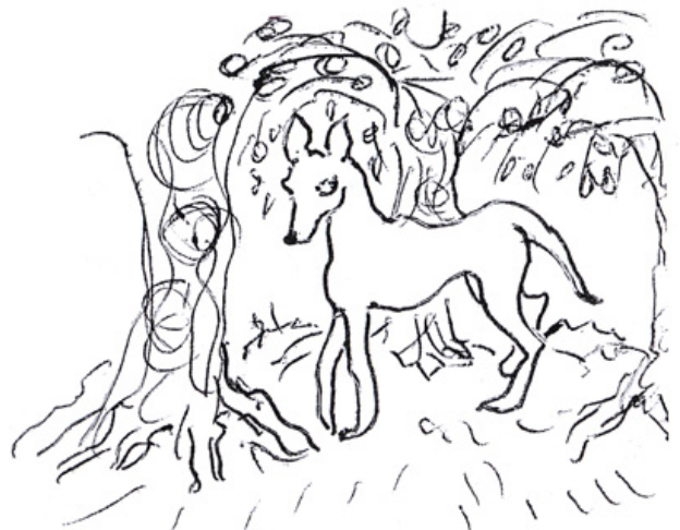
GAZELLE IN A GLADE

Another ole fav'rite in't shafeshiftin' stakes is "Gazel in a Glade" – a very capitivat' aspeck wot has won me choklit bars an' a starrin' roll in a fillum – as you will dixover if you stays