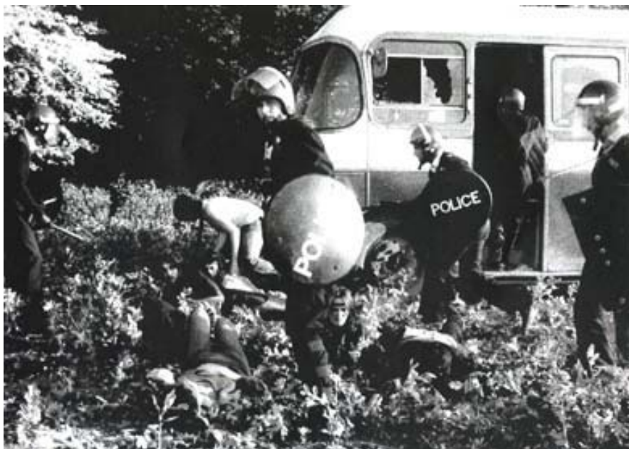
As Featured in "The Battle of the Beanfield" (Ed. Andy Worthington)

http://www.schnews.org.uk/archive/news25.htm